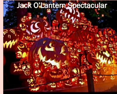
Jack O'Lantern Spectacular