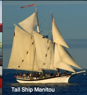
Tall Ship Manitou