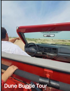
Dune Buggy Tour

*Gratuities for the tour director and driver are not included in the price and are at the passengers' discretion. Please note that the itinerary is subject to change due to COVID restrictions that may be enforced without notice. This tour is non-refundable for cancellations received on or after final payment date.