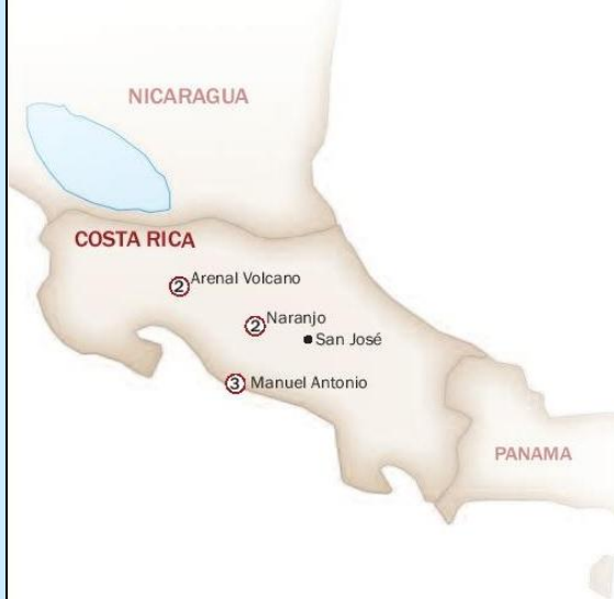
# - No. of Overnight Stays

This tour is operated by a trusted Tour Operator