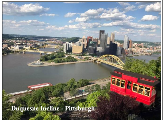
Duquesne Incline - Pittsburgh