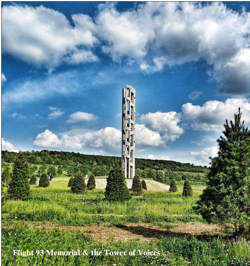
Flight 93 Memorial & the Tower of Voices

We will make our way back to Wisconsin reminiscing about the fantastic time we had on this Outer Banks scenic vacation!