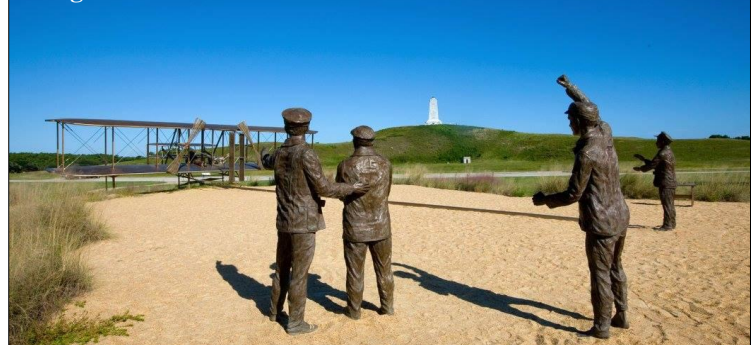
Wright Brothers National Park & Monument

Get ready for a fun day as we start with a Wild Horse Adventure tour . Search for the remaining herd of banker ponies thought to have been stranded from Spanish Shipwrecks centuries ago. Then, we will visit the Currituck Beach Lighthouse (you can climb to the top if you wish, weather permitting). The afternoon is filled with all things "Wright". We will visit the Wright Brothers National Park and Monument and learn more about the famous First Flight! Walk the grounds where history was made and enjoy the museum with a full-scale replica of the Wright Flyer. Dinner will be fantastic at Captain George's Seafood Buffet . If you don't like Seafood, don't worry...there are plenty of other options!