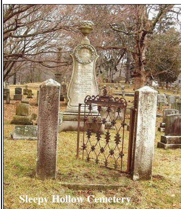
Sleepy Hollow Cemetery

We will make our way back home with lots of memories of our Happy Times in the Hudson Valley!