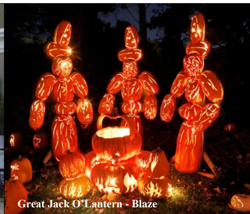
Great Jack O'Lantern - Blaze

*Gratuities for the tour director and driver are not included in the price and are at the passengers discretion. Please note that the itinerary is subject to change due to COVID restrictions that may be enforced without notice. There are many attractions on this tour that are not handicapped accessible due to their historic nature. Tour is non-refundable on final payment date. We highly recommend purchasing the optional travel protection plan.